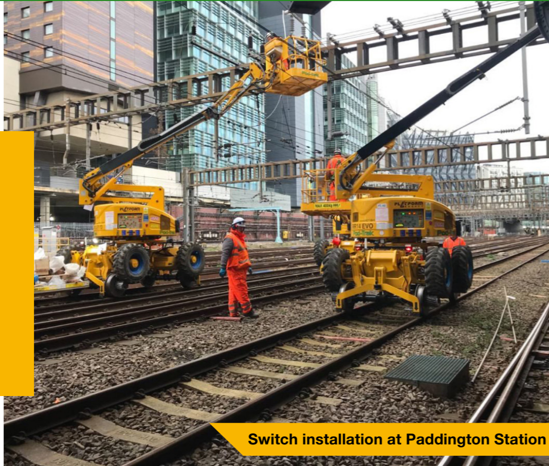
Switch installation at Paddington Station

“Renewal and enhancement of existing overhead line switches between London Paddington and Stockley Bridge 0-12MP”