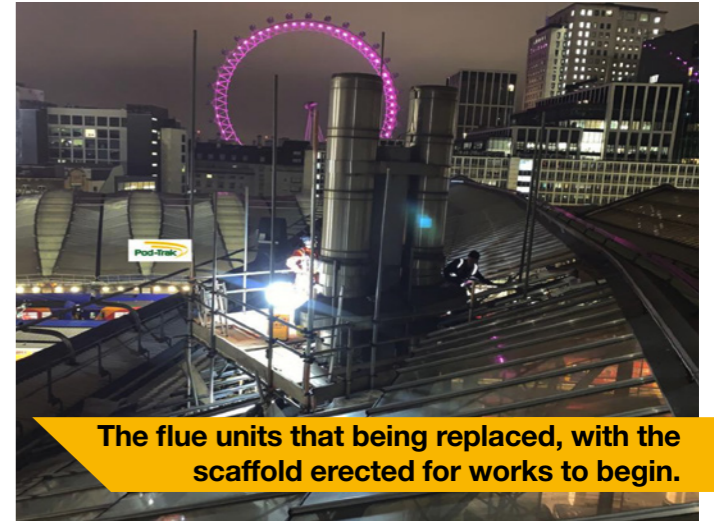
The flue units that being replaced, with the scaffold erected for works to begin.

The projects had some complex works on platform 11 and 12 and 19 to install new flues to the full height of Waterloo station (platform 11 and 12) and install new chillers for the underground retail development on platform 19. Pod-Trak undertook the full rail design process and management for all works including temporary works, hoarding, scaffold and provided plant support for on-track works.