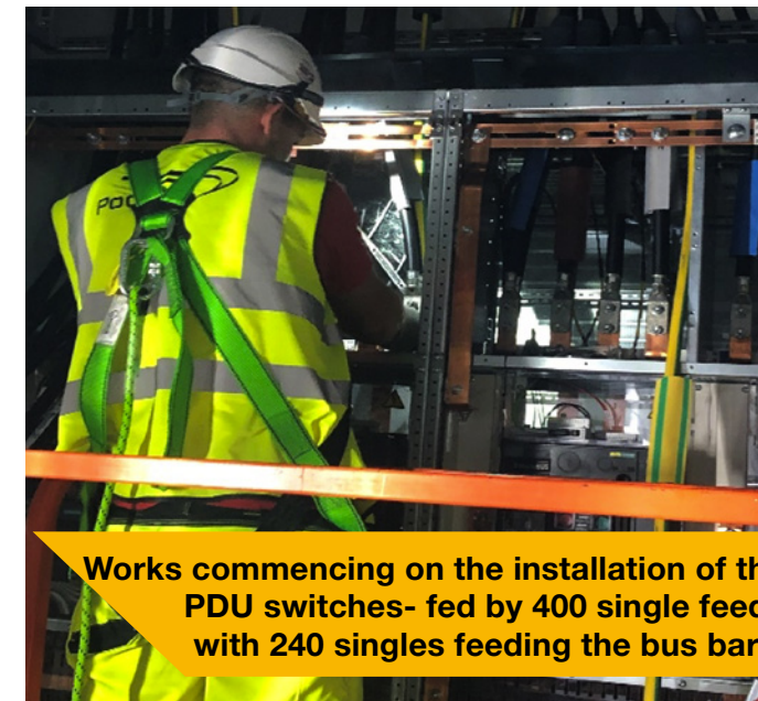
Works commencing on the installation of the PDU switches- fed by 400 single feeds with 240 singles feeding the bus bars.

A 25 man team completed all the works in a 6 week period and Pod-Trak also undertook additional works awarded to them by Winthrop. All systems were successfully handed over on time and budget.