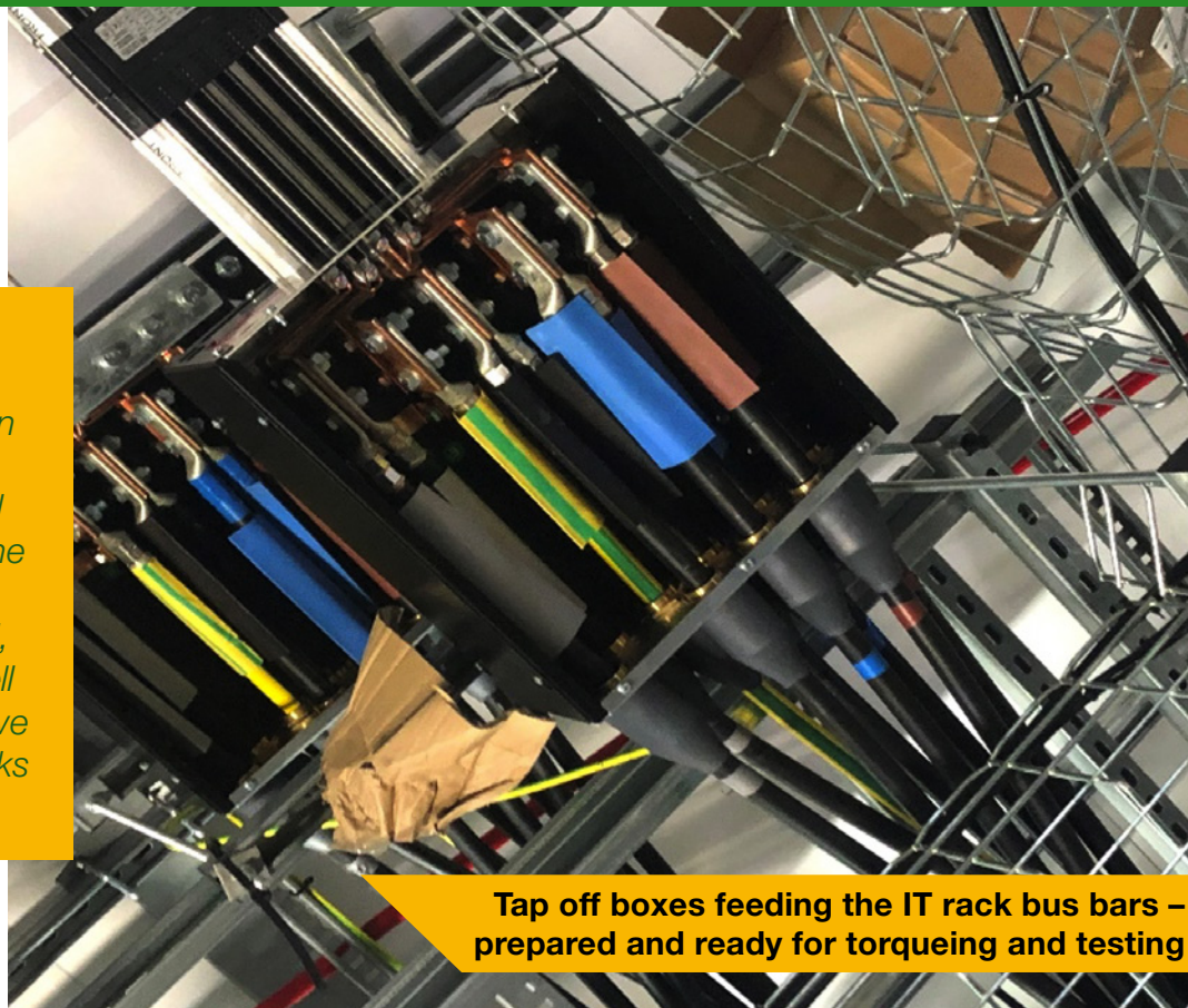
Tap off boxes feeding the IT rack bus bars – prepared and ready for torquing and testing

“Pod-Trak installed, tested and commissioned the entire Colo 1 Cell 1 location in a 6 week period- from mobilisation to testing and handover- all aspects of the install were managed and executed in a professional, well executed manner- well done to all the team and we look forward to future works together.”