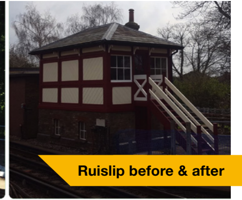
Ruislip before & after