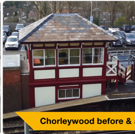
Chorleywood before & after

As part of TfL's Station Works and Improvements Programme (SWIP) they identified two Grade II Listed buildings at Ruislip and Chorleywood stations constructed in the late 1800's that needed to be restored to their former glory.