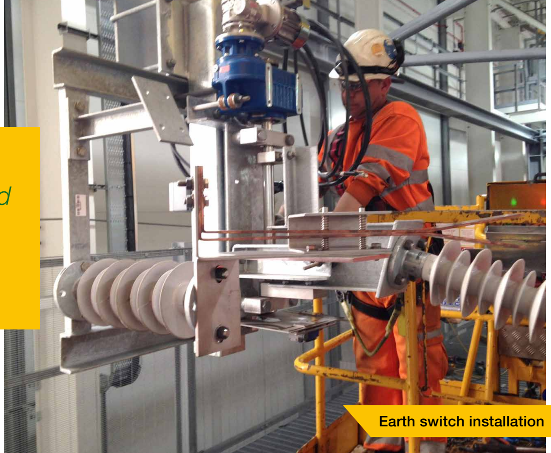
Earth switch installation

“Removal of existing OLE and replacing with a retractable system”