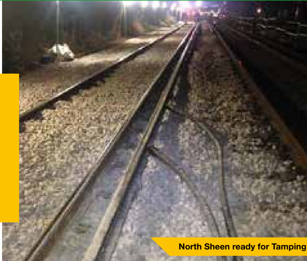
North Sheen ready for Tamping

“The Project saw numerous plain line renewals delivered throughout the South West”