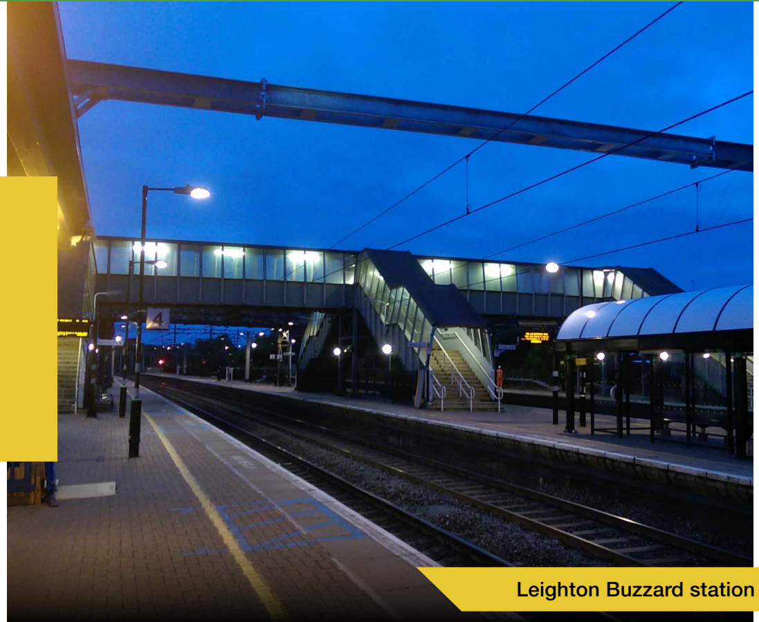
Leighton Buzzard station

“AFA – improving access for all at stations across Bedfordshire”